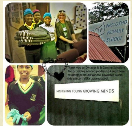
Thank you to Dynacor IT & Gaming Solutions for providing winter goodies to keep these students from Alexandra Township warm this winter! VERY appreciated!

Thoughtfulness and kindness always make my day, & so it was very special to be able to distribute blankets, gloves & beanies to needy children at a school in poverty ridden Alexandra township, thanks to Dynacor IT & Gaming solutions.